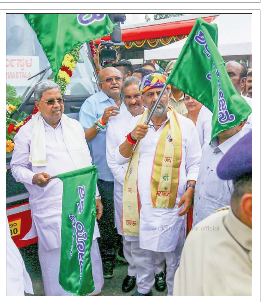
"Shakti" project for women's rights "Shakti" scheme of free travel for women in government buses was launched today.

With every step, we're bridging the gender gap, empowering women to soar higher & conquer new horizons!