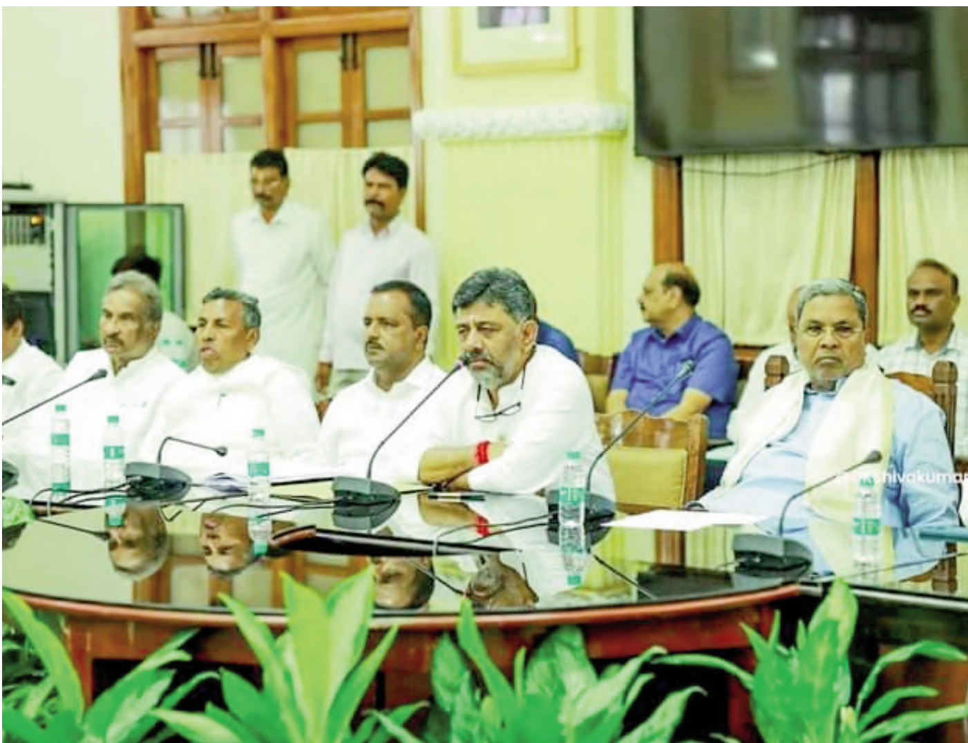
The Congress Legislature Party meeting was held at Vidhana Soudha in Bangalore today. New ministers of the cabinet, legislators and party leaders were present in the meeting.