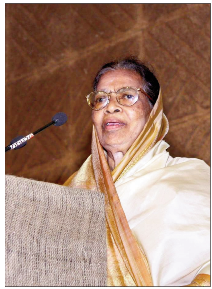
Central Human Rights Commission. Even though she has passed away, the memories of Fatima Beavi will

Fatima Bivi, who rose from Pathanamthitta district to become the first woman judge of the Supreme Court of India, has always been the pride of Kerala. Fatima Beavi achieved this feat at a time when gender inequality was rampant. Their incredible journey continues to inspire every generation. She played an active role in decision-making to bring about long-term changes in the Indian justice system, paving the way for women to pursue legal careers in the judiciary. Fatima Beavi has always been a role model for addressing gender imbalance. Nothing ends with the Supreme Court. Fatima Biwi was also the first governor from the Muslim community. She also served as the first chairperson of the Backward Classes Commission and the first member of the