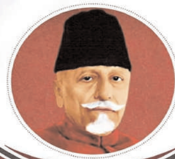
Maulana Abul Kalam Azad 11 November 1888 – 22 February 1958 First Education Minister of India