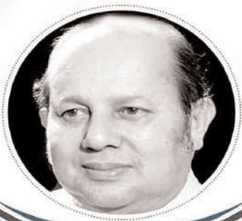
Dev Kant Barooah 22 February 1914 – 28 January 1996 Former Congress President