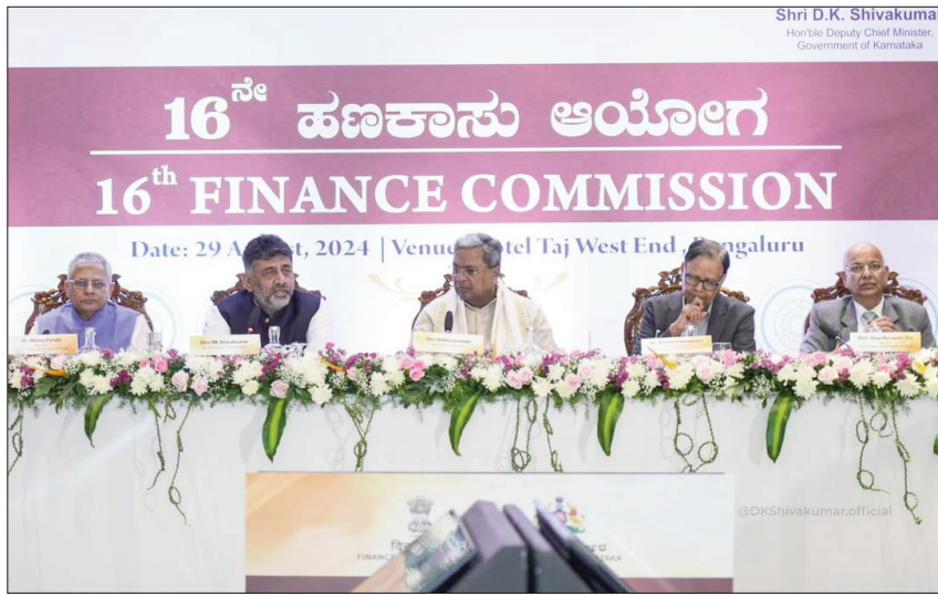
Shri D.K. Shivakumar Hon'ble Deputy Chief Minister, Government of Karnataka