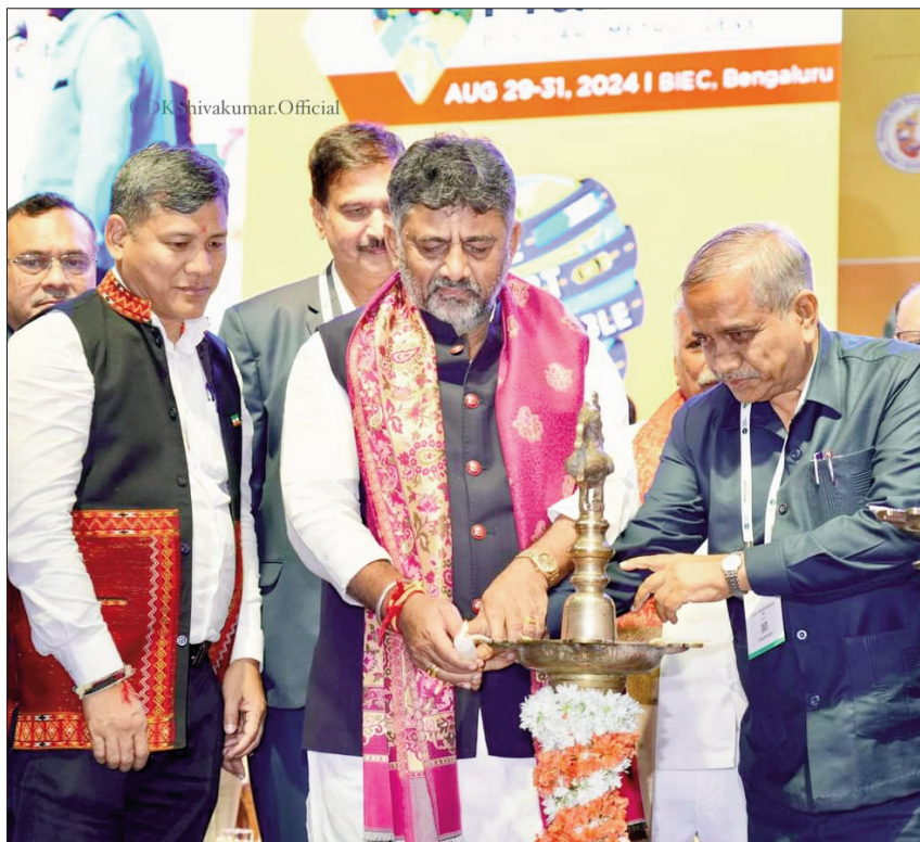
Shri D.K. Shivakumar.Official