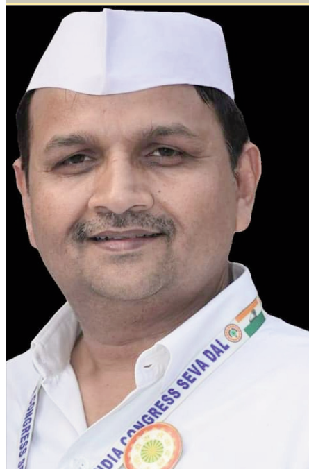
PATNA: CONGRESS DARPAN