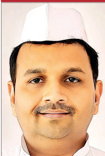
PATNA: CONGRESS DARPAN